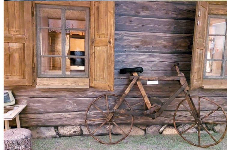
Alytus Regional Museum

The Alytus Regional Museum was established back in 1928. It features modern and interactive expositions that creatively showcase the history of the region. One of the unique exhibits in the museum is the Dzūkai yard (Sodzius Dzūkijon), which showcases the barn and granary, and also allows visitors to touch the exhibits while listening to Dzūkai talk. Visitors can also take a stroll down the Vilnius Street of Alytus in 1915, grab a drink in a tavern, and get a feel of the spirit of that time. Another exhibition that presents the history of Alytus is "Life on the Side of the Nemunas". The museum also hosts exhibitions and educational activities for both students and adults.