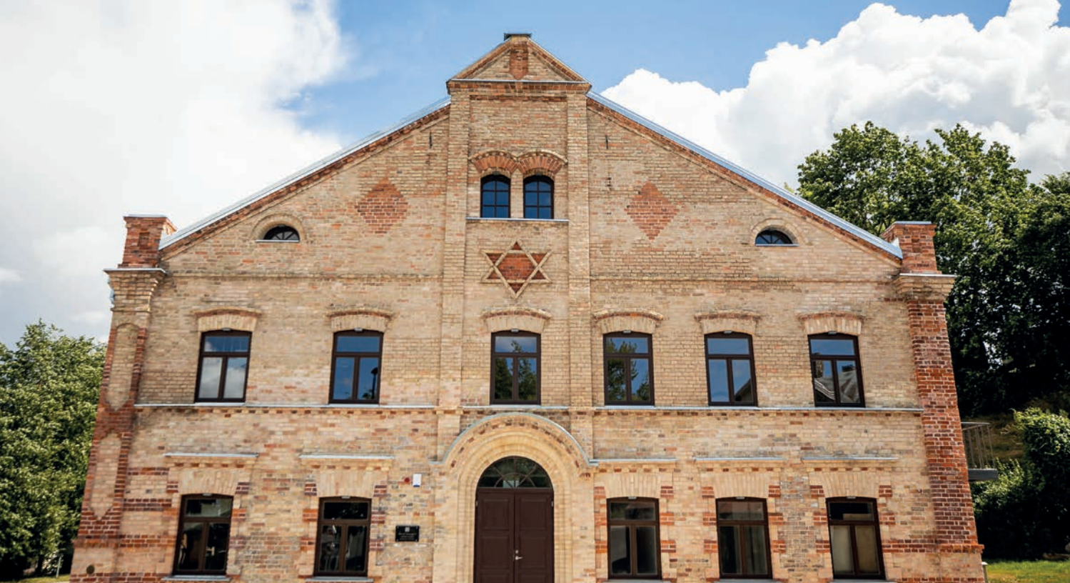
Audiovisual Arts Center (former synagogue)

In 1856, a wooden synagogue was built at this location. At the end of the 19th century, a brick synagogue was constructed either in the same spot or nearby. Unfortunately, during the devastating fires of Alytus in 1909 and 1911, the synagogue burned down. Although reconstructed in 1911, there exists a debate over whether it was a renovation or an entirely new structure based on the original design. A rabbi's house was also built next to the synagogue.