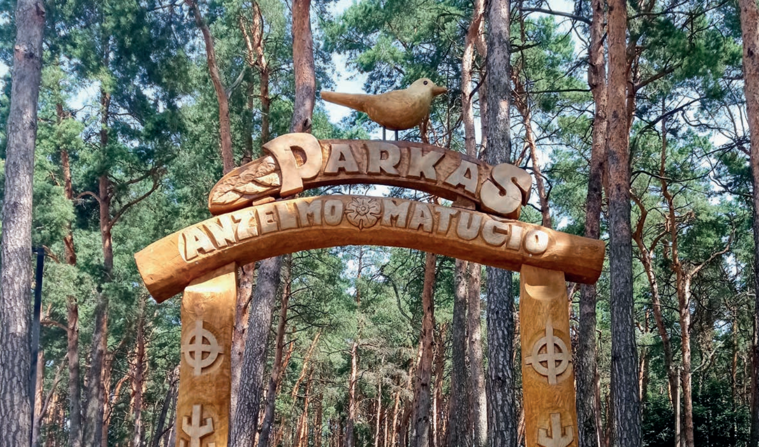
The wood sculptures of the poet Anzelmus Matutis Park

In the park dedicated to the children's poet Anzelmus Matutis, wooden sculptures of characters from the poet's works are scattered playfully. The sculptures were donated by the participants of the biannual International Symposium of woodcarvers and are based on a collection of poems by the poet. The poet's museum is located across the street in the house where A. Matutis lived. The museum has preserved a study room with an authentic interior that includes a library, souvenirs, and personal belongings. The museum offers various educational programs for schoolchildren and families and also showcases children's creations.