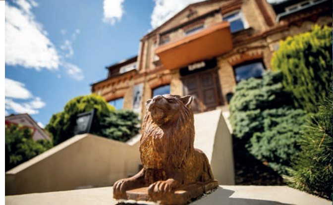
House with lions