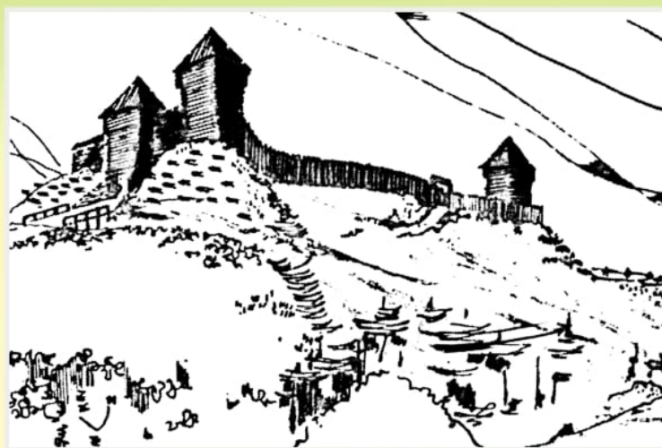
Reconstructive painting of Punia castle by S. Mikulionis

At the foot of the mound, the spring of Nečiukos falls into the stream of Punelė. The spring was named after a masonry which used to stand nearby.