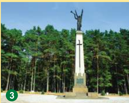
“Angel of Freedom” Monument D5