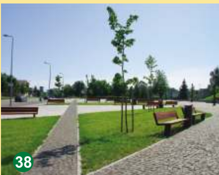
Square of Alytus I C6