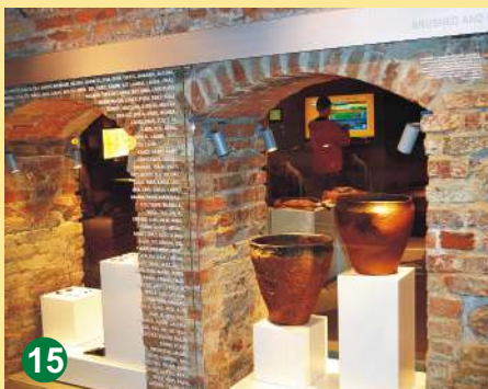
Archaeological Exposition of the Alytus Museum of Ethnography C6