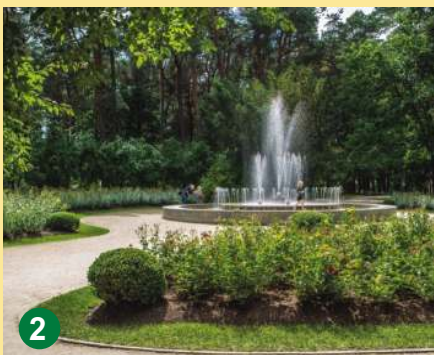
Town Garden D5