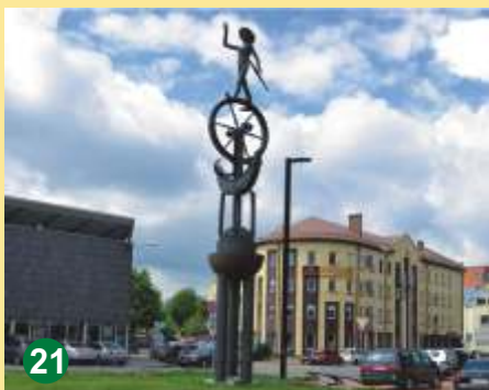
“Patrimpas” Sculpture D4