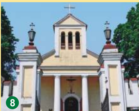
St. Ludvick Church C5