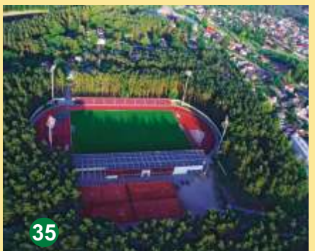
Town tennis courts and stadium D5